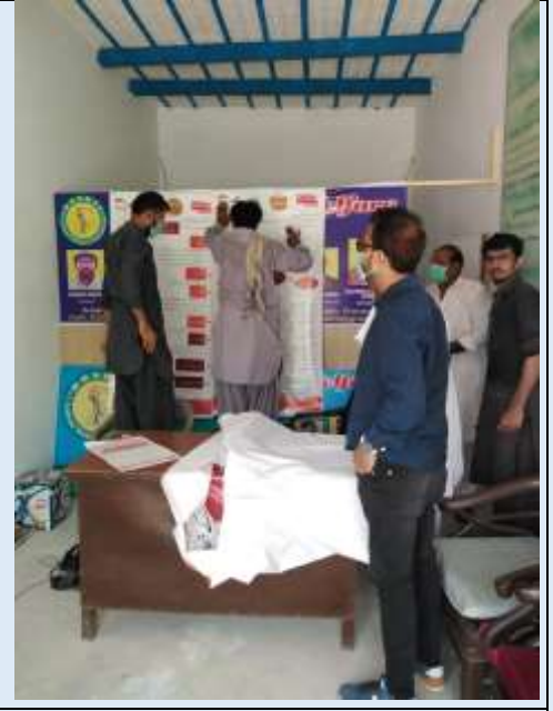
The distribution of banners on COVID -19 SOP'S @ OPA Bin Qasim Pipri Under HelpAge Proejct