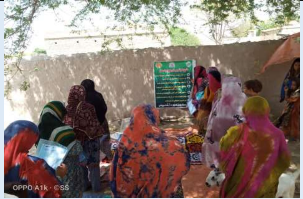
COVID-19 Awareness Sessions with communities at District Khairpur