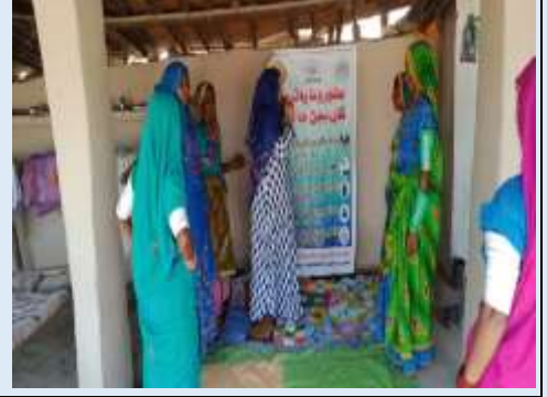
COVID-19 Awareness Sessions with communities at District Mirpurkhas